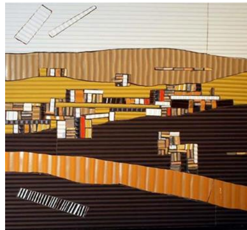
Figure (15) Muhammad Bennawi, Miscellaneous materials and stone mosaic 60 cm x 50 cm, 2010