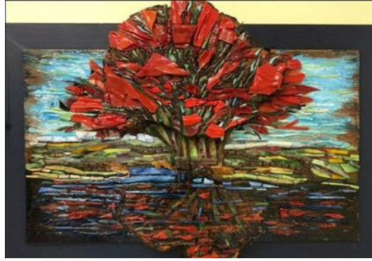
Figure (13) Jihan Madkour - a tree ... glass and mosaic Figure (14) Jihan Madkour - a variety of materials ... glass

Mosaic with wood, 60 cm x 90 cm - 2017 Epoxy with wood - 70 cm x 95 cm - 2017 m