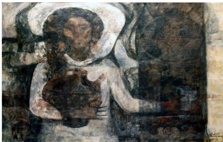
Figure (9) Ahmed Nabil Suleiman - the carrier of the jug - Tempra on canvas - 65 cm x 80 cm - 1965

in front and back. The artist inspired by its color coding that the milk bottle is mixed with light, which was repeated with that small, enlightening bottle in the lower left corner.