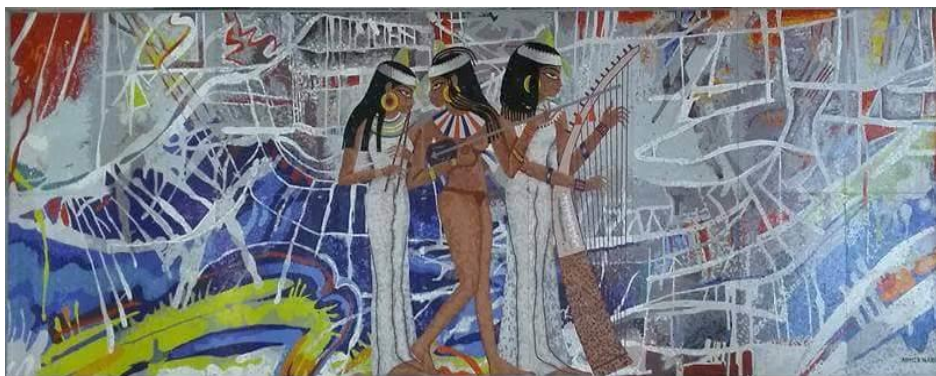
Figure (12) Ahmed Nabil Suleiman, Female Players, Mosaic, 3m x 9m, 2017, Terminal 3, Cairo Air Port, Egypt.

Figure 12 (Female playlers) shows Ahmed Nabil's inspiration for the elements of the ancient Egyptian heritage and mixing it with the contemporary vision that is evident in the treatment of the background. It reminds us of the hills of the desert environment and creates an infinite rhythm of movement and conflict between the old and the modern.