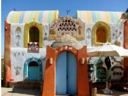
Figure (3) Nubian House, Nubia, Egypt.

columns, or stars. Nubians are not satisfied with this amount of decorations, rather, they decorate these facades sweetened with bas-relief or relief with ceramic dishes mostly white or blue that are thrown on the walls. These dishes when seeing from a distance, seem as if they depict suns or planets thanks to the luster, glitter and shine that they acquire in some times of the day when the sun rays fall on them. (6,43) See Figure No. (3) and Figure No. (4).