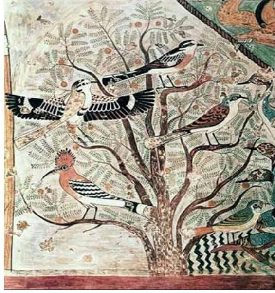
Figure 1 "Birds on the Acacia tree"

The art of that period is characterized by a clear tendency of decorations, as the artist uses some units such as a helical or spiral line symbolizing the flow of water, the swastika to denote the good omen or the expression of the four seasons of cultivation. Likewise, he uses the zigzag lines to indicate the flow of water, he draws a kind of plants that is similar to the willow symbolizing a type of plant that rejuvenates the vitality of human being. He at other times paints squares and triangles inscriptions to express some other symbols related to agriculture. As for animals such as crocodiles, seahorse and types of pelicans, which were abundant in various swamps flooding the country at the time, he depicts them very brief and very similar to the linear motifs of nature decorative. These drawings which were carried out on the stones and sometimes on the pottery, disappeared gradually at the beginning of the Dynasties era (7,9). The ancient Egyptian artist was able to draw inspiration from nature, including birds and animals, and to record on the walls of these Mastabas a complete picture of the Egyptian life and the nature in which he lives, from plants, globe, sycamore trees and peasant animals such as the ox. These inscriptions were colored with bright colors in which he did not resort to tricks of shade and light, but rather were clear colors derived from his land and his plants (2,7)