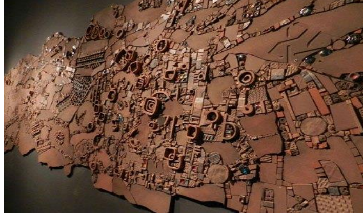
Figure (17) Muhammad Bennawi, Al-Wadi, Miscellaneous materials, clay, glass and stone mosaic, 500 cm x 150 cm, 2013

from the perspective of bird eye where the eye of the viewer moves between the desert paths, valleys and houses that tend to be circular in design. The artist used in it various materials of clay, glass and metal to give a visual symphony to the viewer mixed with the spirit of the nature of the desert environment.