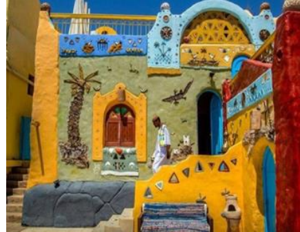
Figure (4) Nubian House, Nubia, Egypt

The desert environment architecture is characterized by noticeable cleanliness, as most of the houses are covered with lime, and its doors and facades are decorated by oxides from the desert environment. "Nubian architecture witnessed a great revival in the first half of the twentieth century as houses were well designed, with wide area and were built by stones or mud bricks, and were painted in details with bricks. These houses attracted the admiration of many Egyptian and foreign artists who visited Nubia before Lake Nasser erased all traces of the Nubian villages. (20,32)