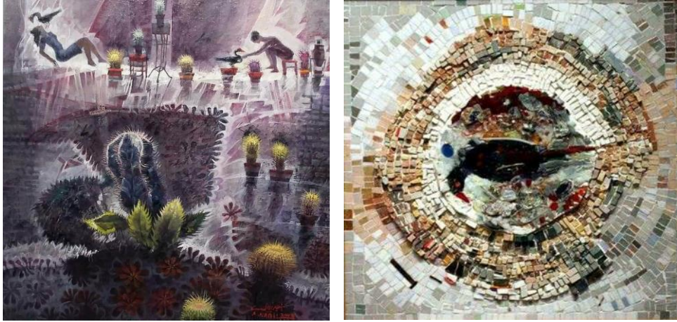
Figure (10) Ahmed Nabil Suleiman, Nahr al-Nur, glass Fused, marble, and emeralds, 100 cm x 90 cm 2015.